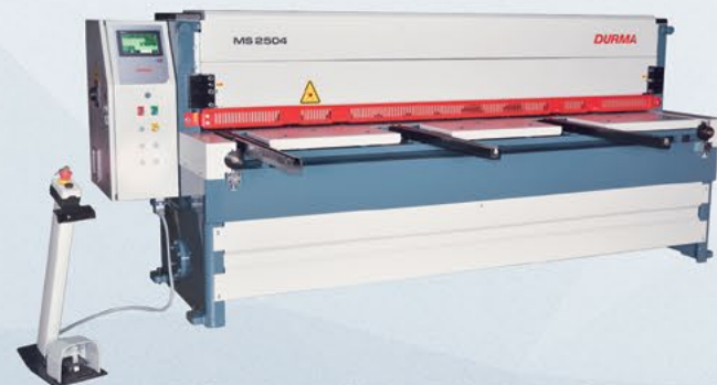
POWER OPERATED SHEAR