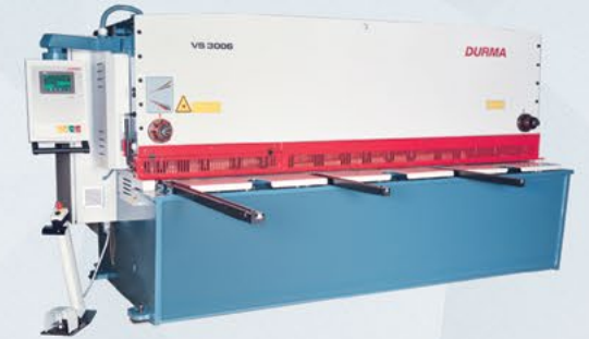
VARIABLE RAKE SHEAR