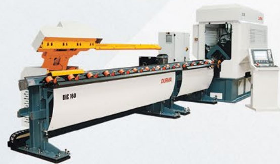
L ANGLE PROCESSING CENTER